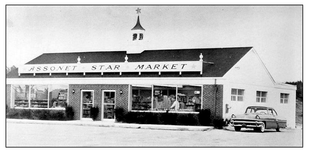
THE ASSONET STAR MARKET, CIRCA 1960