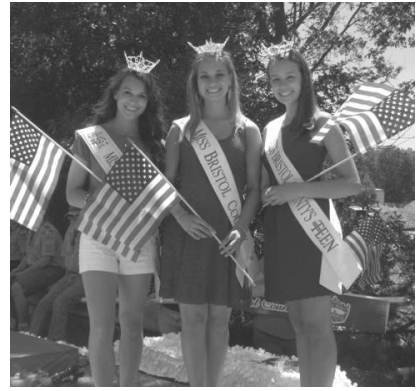
Miss Mass. Outstanding Teen, Miss Bristol County, & Miss Bristol County Outstanding Teen