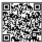
Excise Tax Abatement Application

You can apply for an abatement ONLINE by scanning the QR code to the right, or by visiting our website at freetownma.gov/mvabatement