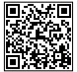
MA's Online Voter Registration Portal

Online - To register to vote online, you must have a signature on file with the Registry of Motor Vehicles. In addition to registering, you can update your address, or change your party affiliation. You can register at VoteInMA.com or by scanning the QR code at right.