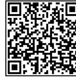
Online Dog License Renewal

Payments can be made in-person at the Town Clerk's office (3 North Main St. in Assonet) during normal business hours, or paperwork can be dropped off in the white drop box in front of Town Hall. If you have an up-to-date rabies certificate on-file with the Town Clerk's office, you can also renew online at https://www.freetownma.gov/dogs or by scanning the QR code at right.