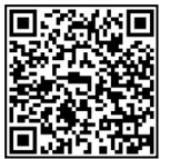
Voter Registration Form

By Mail – Residents can download a mail-in voter registration form from freetownma.gov/elections or by scanning the QR code at right. Forms can be mailed to P.O. Box 438, Assonet, MA 02702 or dropped off in the white dropbox in front of Town Hall (3 North Main Street in Assonet)